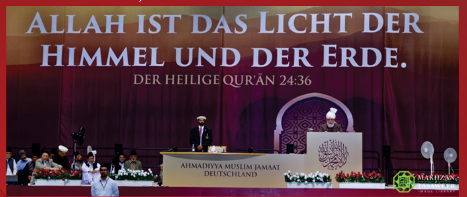
3-day Annual Convention to begin in Karlsruhe later today

INSPECTION OF JALSA SALANA GERMANY 2016 TAKES PLACE